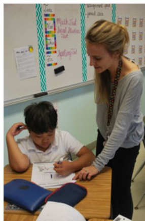
It's where I'm making a difference in the lives of my students.