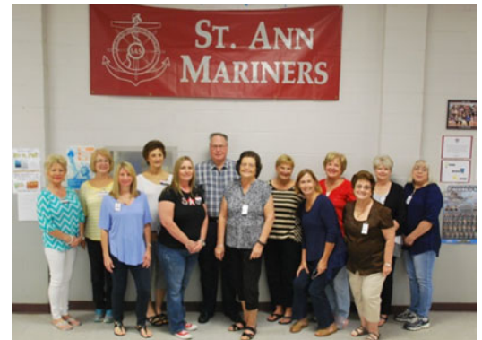
It's where my grandchildren are preparing to be the leaders of tomorrow.