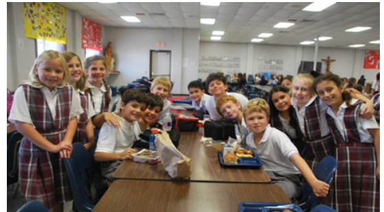
It's where I'm making friends and getting ready for high school.