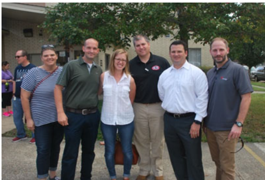
It's where my children are thriving and growing socially, spiritually and academically.