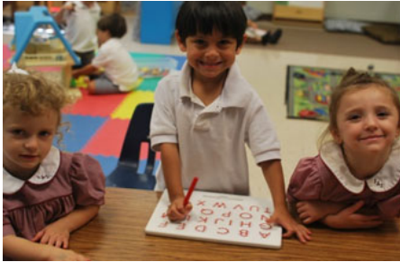
It's where I'm learning my ABC's and how to write my name.