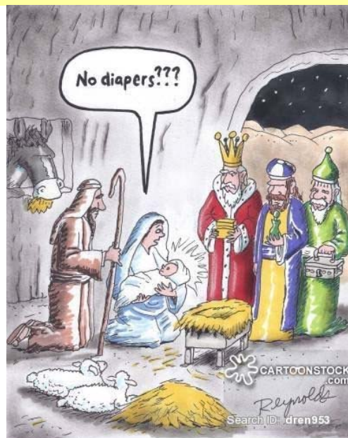
The First and Last Male Sponsored Baby Shower

Our second Grade students recently received their First Reconciliation on January 31 here at St. Ann Church. Please congratulate them as they work to prepare for their First Eucharist in April!